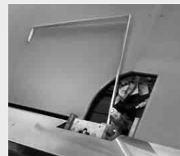
Cut a good figure in all bending machines: Thermix® TX.N