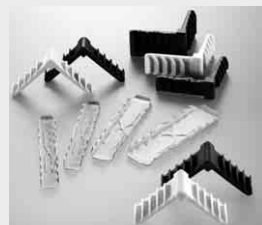
Corner keys and straight connectors to fit Thermix® TX.N

glass manufacture – regardless of whether you produce plugged or banded frames.